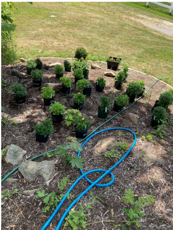
Potted chrysanthemums in temporary location growing for late summer planting in various flower beds.