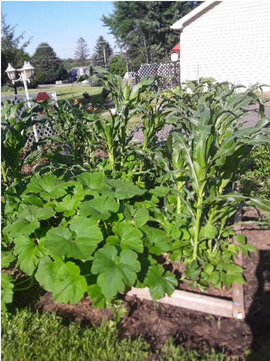
3 Sisters Garden