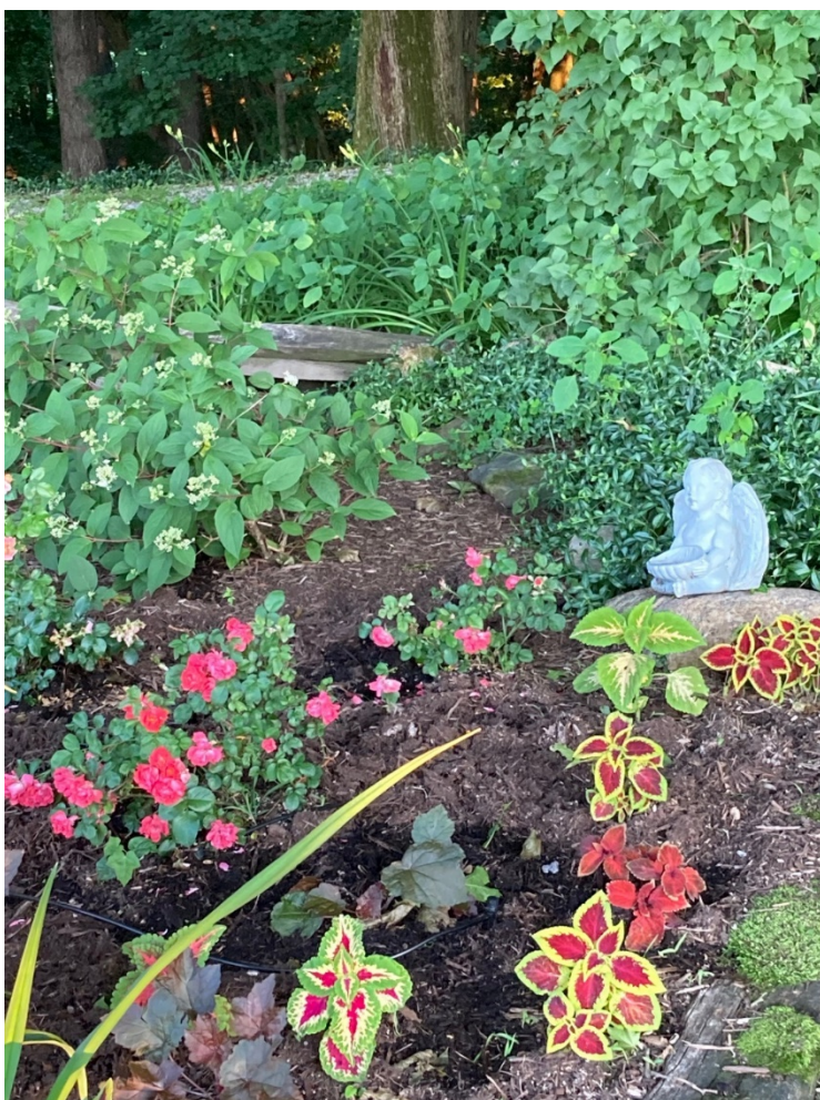
Close up of a section of Grandma's Garden showing Coleus, Burgundy Coral Bell, Drift roses and Fire and Ice Hydrangea.