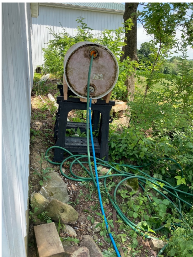
Gravity flow watering tank to water chrysanthemums. Not a pretty landscape feature but it is tucked behind a machine shed. Much better than carrying buckets of water up the hill!