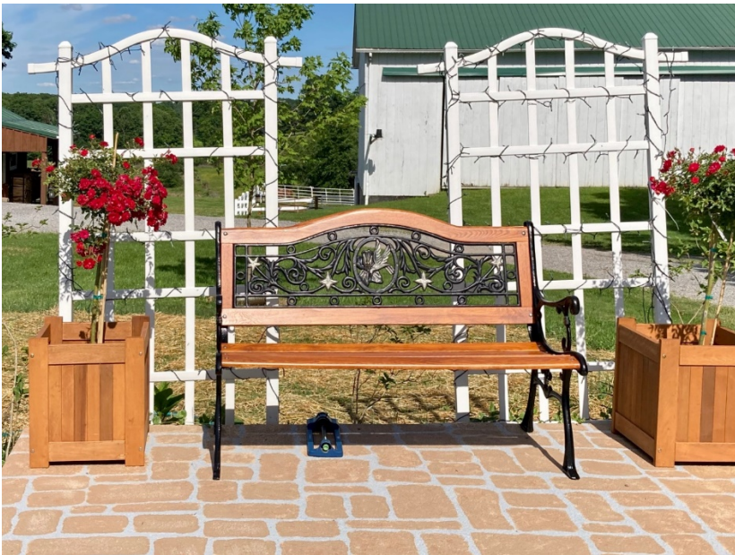
Refurbished park bench on faux painted well pit cover flanked by tree roses in planters. This year's project.