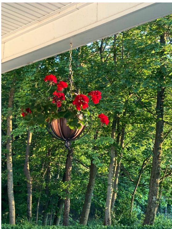
One of the hanging baskets on the front porch