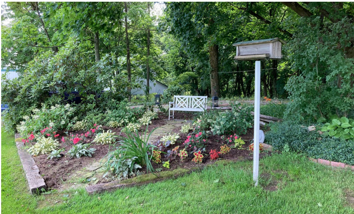
“Grandma’s Garden” Created originally for my mother in law in the late 70’s so that she could enjoy flowers from the kitchen window.