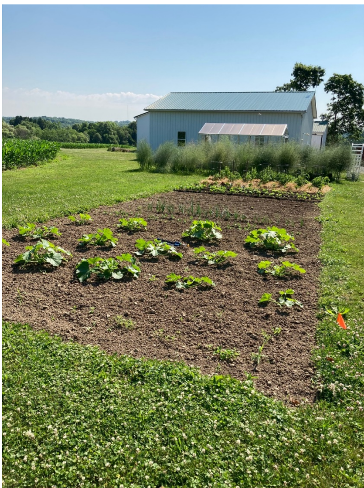
Vegetable garden with squash and pumpkins in foreground and asparagus fronds near the greenhouse. Plants are much larger now. We have been watering with a soaker hose and we actually had some beneficial rain.