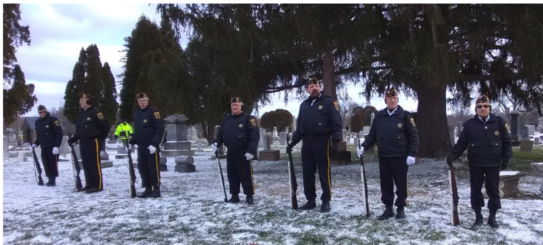
Wreaths for Veterans - 2018