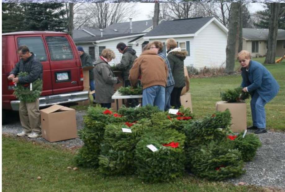
Wreaths for Veterans - 2013