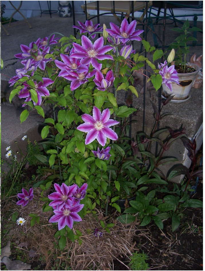
Before Pic – 2017