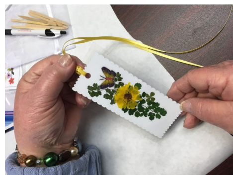
Pictures from the Garden Art Series— Botanical Cards taught by Peg Zeleznik—MGV