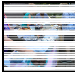
The feast at August's Meeting