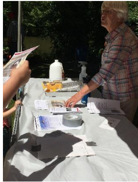
Mahoning Riverfest – June 3rd