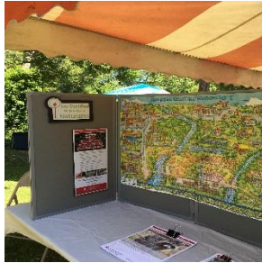
Mahoning Riverfest June 3rd

"A garden must combine the poetic and the mysterious with a feeling of serenity and joy."