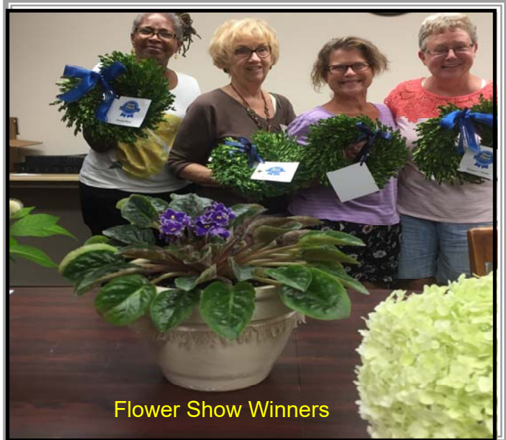
Flower Show Winners