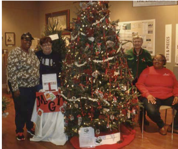
Decorating 2015

The tree decorating date and time will be announced at the meeting. Bring your scissors and prepare for fun.