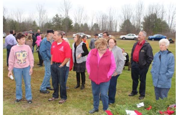
Ellsworth Set-up 2015

This represents our annual effort to remember our fallen U.S. veterans, to honor those who serve and to teach children the value of freedom.